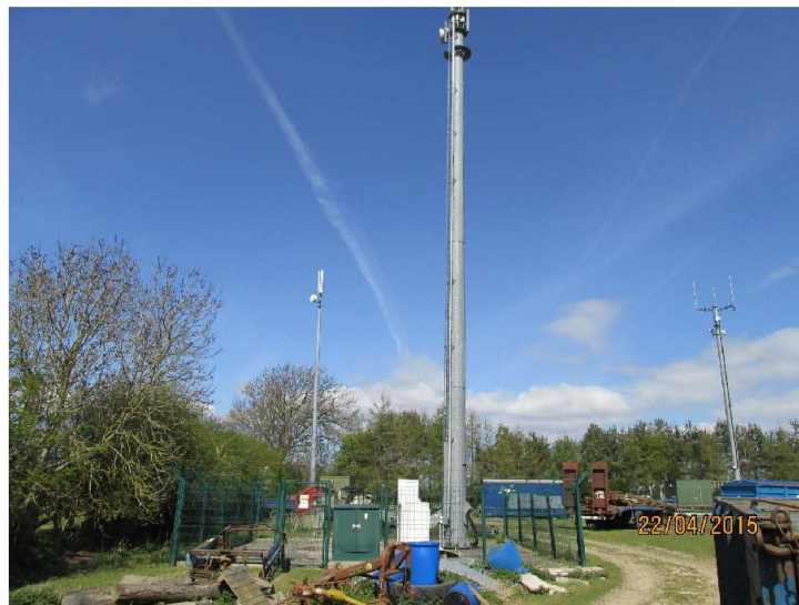
Figure 2. Photo of application site.